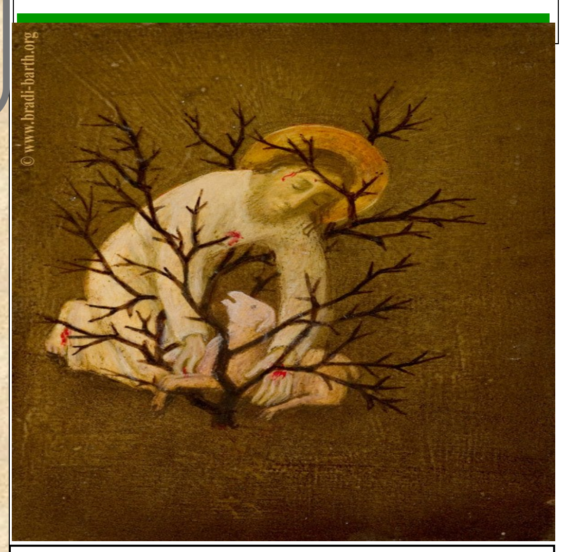
Lc 15:4-6 "What man among you having a hundred sheep and losing one of them would not leave the ninety-nine in the desert and go after the lost one until he finds it? And when he does find it, he sets it on his shoulders with great joy and, upon his arrival home, he calls together his friends and neighbors and says to them, 'Rejoice with me because I have found my lost sheep.'.